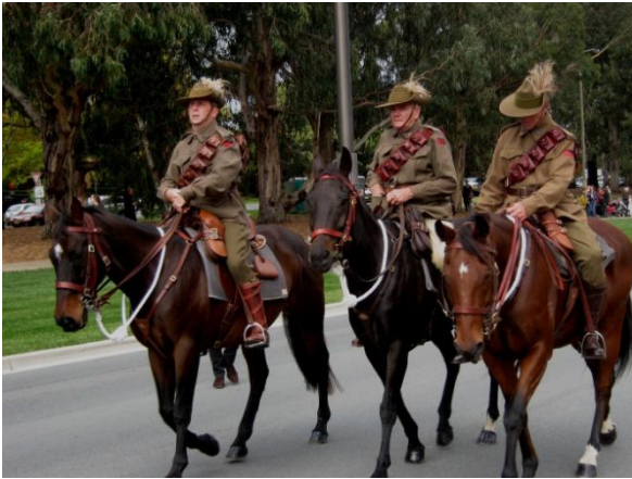
Mounted Troopers leading the Anzac Day Parade