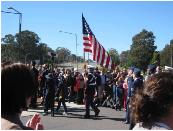
US parade contingent march