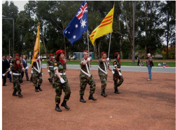
Vietnamese parade contingent march