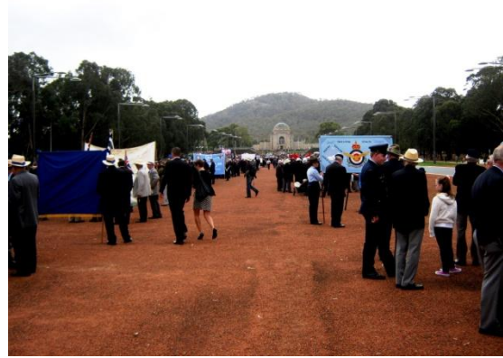
Veterans assembling in front of the Australian War Museum