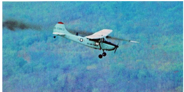
The twin-boom Super Skymaster makes it mark with a smoke rocket.

The FAC flies low and slow over his target, marks it with smoke grenades and smoke rockets, and calls in strike aircraft or artillery support. He remains near the target, working with the tactical pilots so bombs and other weapons hit the target with maximum precision.