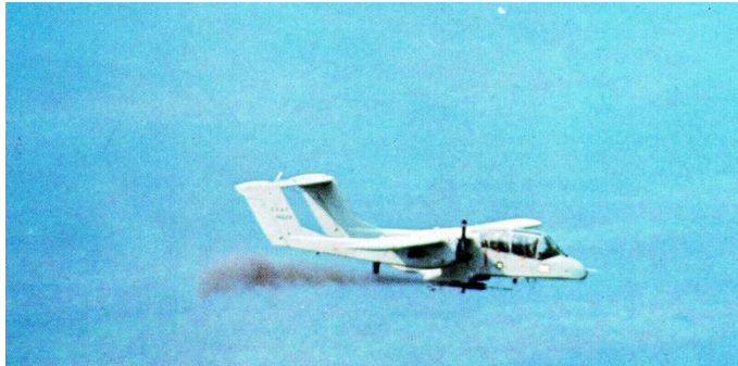
The OV-10 Bronco, newest FAC aircraft in the U. S. Air Force arsenal.

The forward air controller (FAC) in Vietnam has proven to be one of the most effective weapons against Viet Cong activity. FACs have been cited numerous times as being the single most effective element in spotting the enemy and winning a battle.