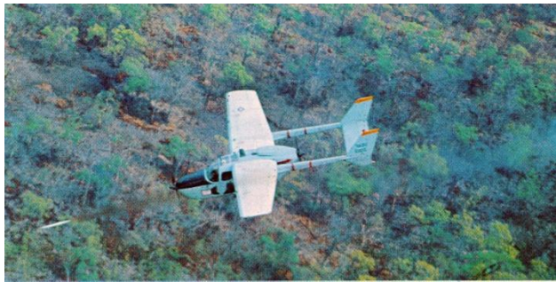
The O-1 Bird Dog has been used in Vietnam since the beginning of the war.

FACs use the O-1 Bird Dog, the O-2B Super Skymaster, the OV-10 Bronco and other aircraft over the Republic of Vietnam to seek out the enemy wherever he may be hiding. Once the enemy is located, FACs request approval from proper authorities for tactical air strikes on the target area.